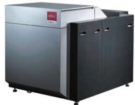
Plate sizes range from 9" x 8-5/8" to 16-5/16" x 22-13/16". The Eco 1630III produces up to 2400 dpi and up to 175 lpi with output production of up to 81 plates per hour.

The SDP-Eco 1630III uses up to two-thirds less processing chemistry than current analog and digital systems. It features a self-contained processor that operates with two new, ready-to-use chemistries for processing Silver DigiPlate™ paper on polyester plate materials.