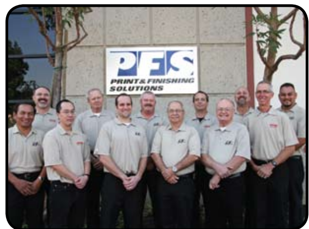
The PFS Service Team specializes in pre-press, press and bindery machinery. We offer local service, preventative maintenance programs, and 24-hour service.