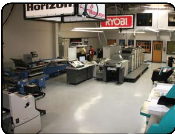
The PFS working showroom features new and used machinery and is available for live demonstrations. Please contact your sales professional today at (800) 398-5283 to schedule an appointment.